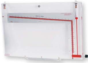
Inclined-vertical manometer single column