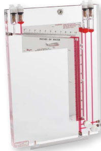
Inclined-vertical manometer double column