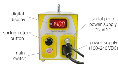
Operation and display elements of ATM 228.