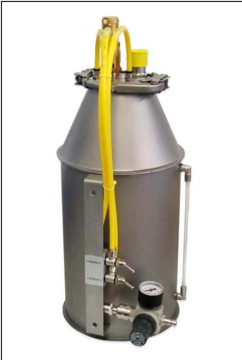
Aerosol Generators series ATM 241

The aerosol generator ATM 241 is a droplet generator and especially developed for generating high aerosol concentrations with exceptional constancy (VDI-guideline 3491).