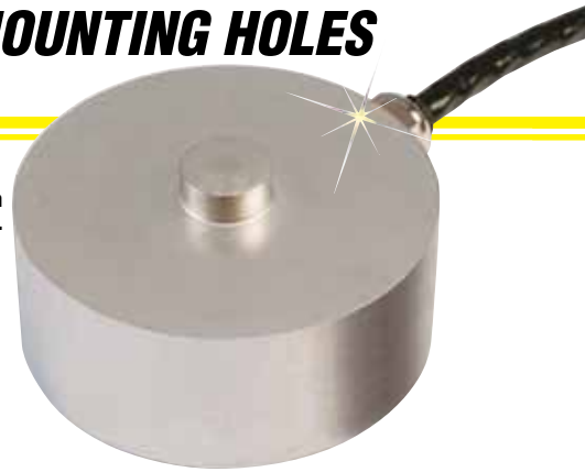
LC305-1K, shown actual size.

Available with cable or twist-lock connector.