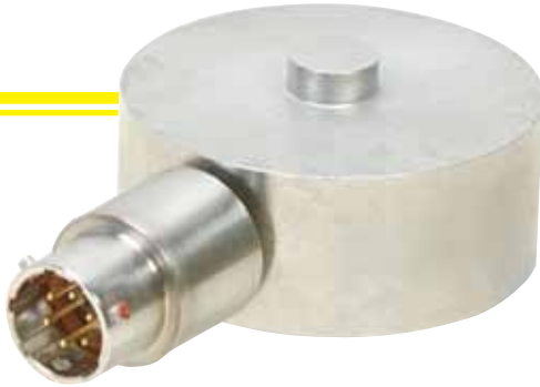
LC315/LCM315 models with twist-lock connector.