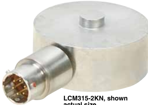
LCM315-2KN, shown actual size.

Available with cable or twist-lock connector.