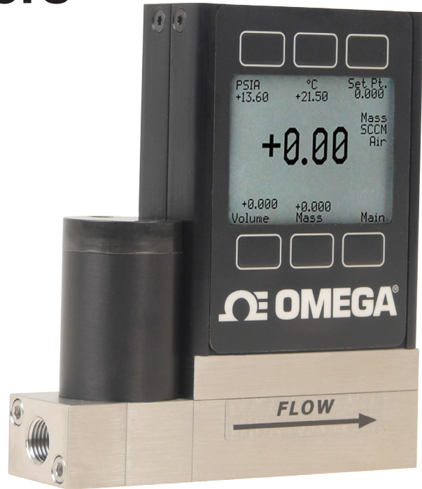
FMA-2601A shown smaller than actual size.

The controller uses a true proportional valve coupled to the flow body to control flow using the integral PID loop controller. Standard units include a 0 to 5 V output (4 to 20 mA optional) and RS232 communications. The gas-select feature and the setpoints can be adjusted from the front keypad or via RS232 communications. Volumetric flow, mass flow, absolute pressure, and temperature can all be viewed or recorded through the RS232 connection. It is also possible to multi-drop up to 26 units on the same serial connection to a distance of 46 m (150').