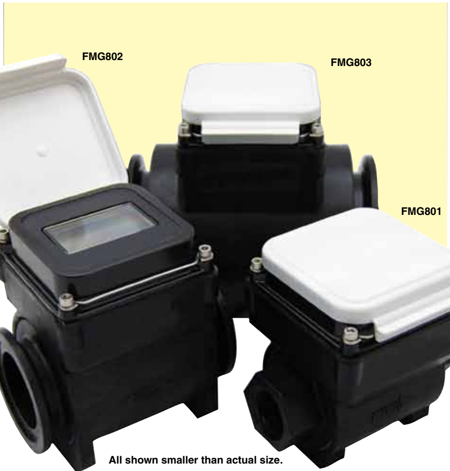
All shown smaller than actual size.

The FMG800 Series is used for tracking flow rate and total flow in usage monitoring applications including wells, industrial wastewater, heap leach mining discharge, cooling tower deduct, turf, landscape, and other water reclamation applications. In the event of DC power loss, or when changing batteries, the FMG800 will retain internal settings and flow total.