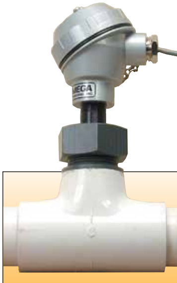
SYS/FP7002/FP7007 system includes an FP7002 flow/temperature sensor with FP7007 fitting, calibrated for 2 to 30 GPM flow.

Temperature Range: 0 to 100°C (32 to 212°F) Accuracy: ±1.7°C (3.1°F) Power: 12 to 18 Vdc @ 30 mA Output: 2-wire, 4 to 20 mA (1 to 5 Vdc with external 250 Ω resistor) Maximum Loop Resistance: \Omega = (V_{\text{supply}} - 12V) / 0.02 A