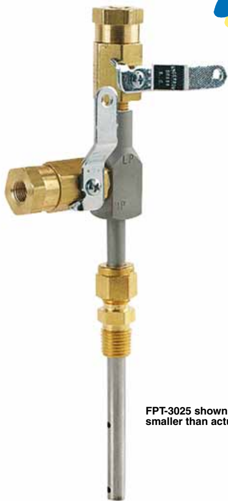
FPT-3025 shown smaller than actual size.

The FPT-3000 Series in-line flow sensors are two averaging pitot tubes for compatible gases and liquids. They provide accurate and convenient flow rate sensing for a schedule 40 pipe, when purchased with a suitable differential pressure gage with appropriate range. Extremely reliable, proven technology, pitot tubes, have been used in flow measurement for years. Multiple sensing point measurement and built-in averaging capability eliminates the need for "traversing" the flowing stream with single point velocity pressure measurement which saves time.