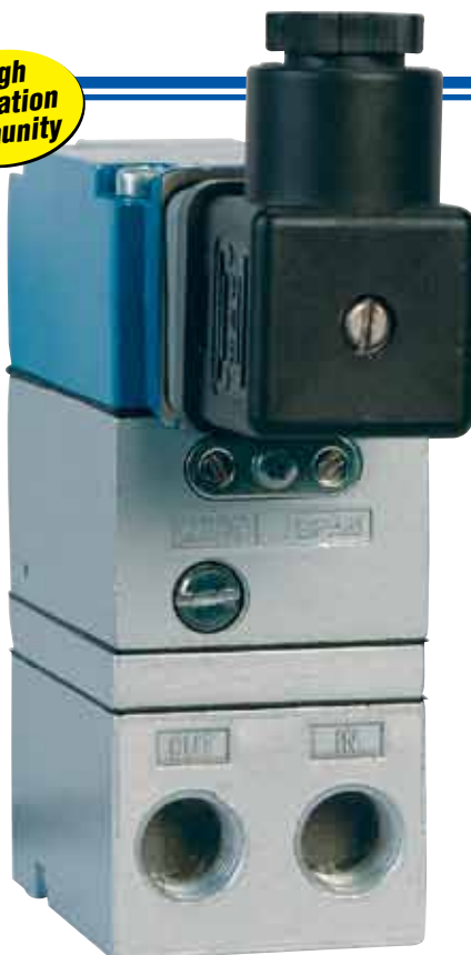
IP710-X100-D with DIN electrical termination shown actual size.

The IP610 and IP710 are electronic pressure regulators, converting a 4 to 20 mA signal to a proportional pneumatic output. Both units feature a compact housing, accessible ports and easy adjustments, making them ideal for space-constrained applications. They also feature high tolerance for impure air and an integral volume booster, providing high flow capacity, increasing control speed in critical applications.