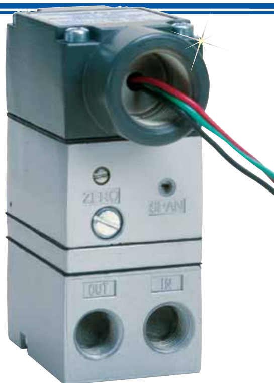
IP610-X60 with conduit electrical termination shown actual size.

The IP610 is an economical unit, with precision air pressure regulation for actuators, valves, positioners and other final control elements.