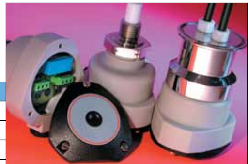
LVCN4000 Series, shown smaller than actual size.