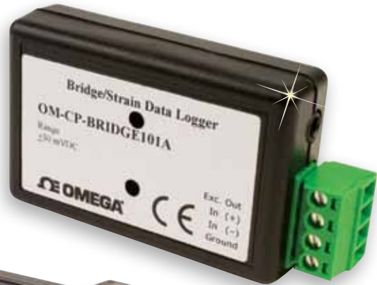
OM-CP-BRIDGE101A, shown actual size.

The storage medium is non-volatile solid state memory, providing maximum data security even if the battery becomes discharged. Its small size allows it to fit almost anywhere.