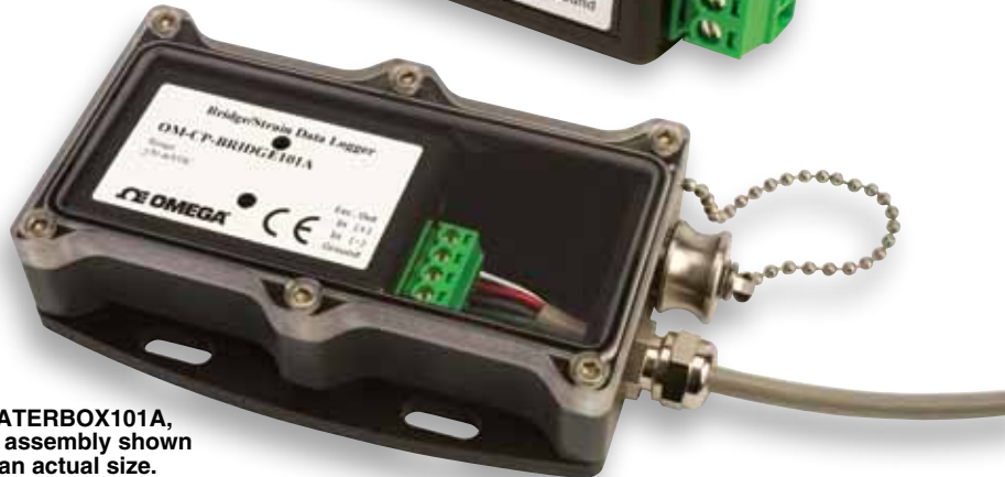
OM-CP-WATERBOX101A, enclosure assembly shown smaller than actual size.

The OM-CP-BRIDGE101A was designed with our customers in mind. There are free firmware upgrades for the life of the product so that data loggers already deployed in the field can grow with new technological developments. Units do not need to be returned to the factory for upgrades. The user can do this automatically from any PC.