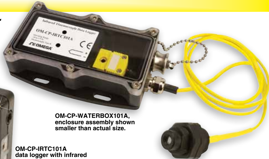
OM-CP-IRTC101A data logger with infrared thermocouple, shown actual size.