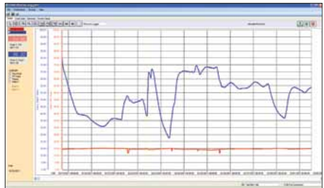
Windows software (included) turns your PC into a real time data acquisition system.

The Windows software is a powerful data acquisition package and is included with every OM-PR Series data logger. It allows for easy setup, retrieval, interpretation and export of the recorded data. Simply connect your data logger to an open USB port and begin communicating immediately.