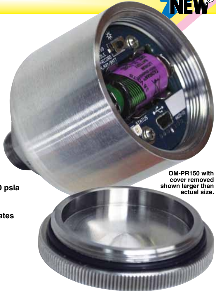
OM-PR150 with cover removed shown larger than actual size.

The OM-PR Series pressure/temperature data loggers are battery powered stand alone water tight compact data loggers that record up to 64,000 samples of pressure and/or temperature data. These data loggers can be configured to record pressure and temperature or a parameter alone to maximize data storage space.