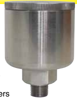
OM-PR150 with cover on.