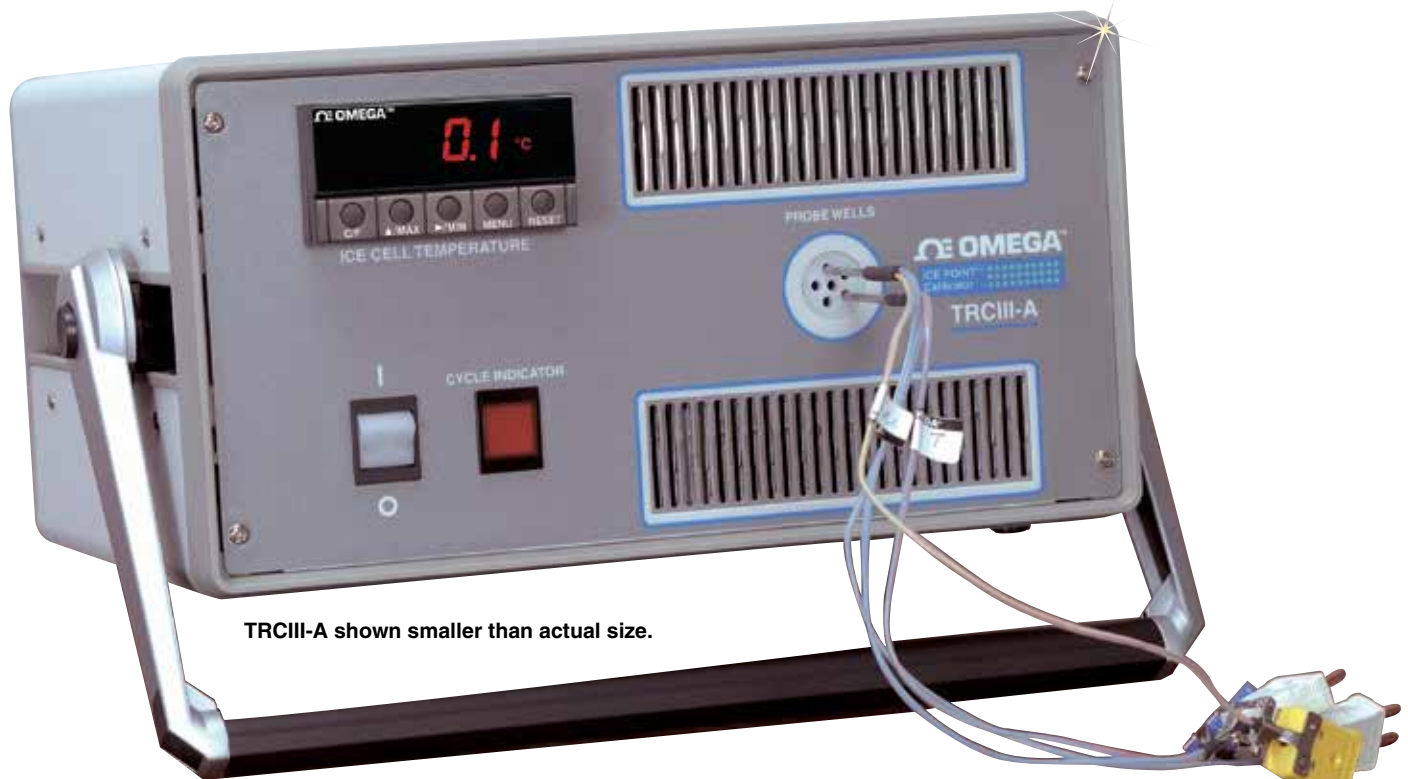
TRCIII-A shown smaller than actual size.